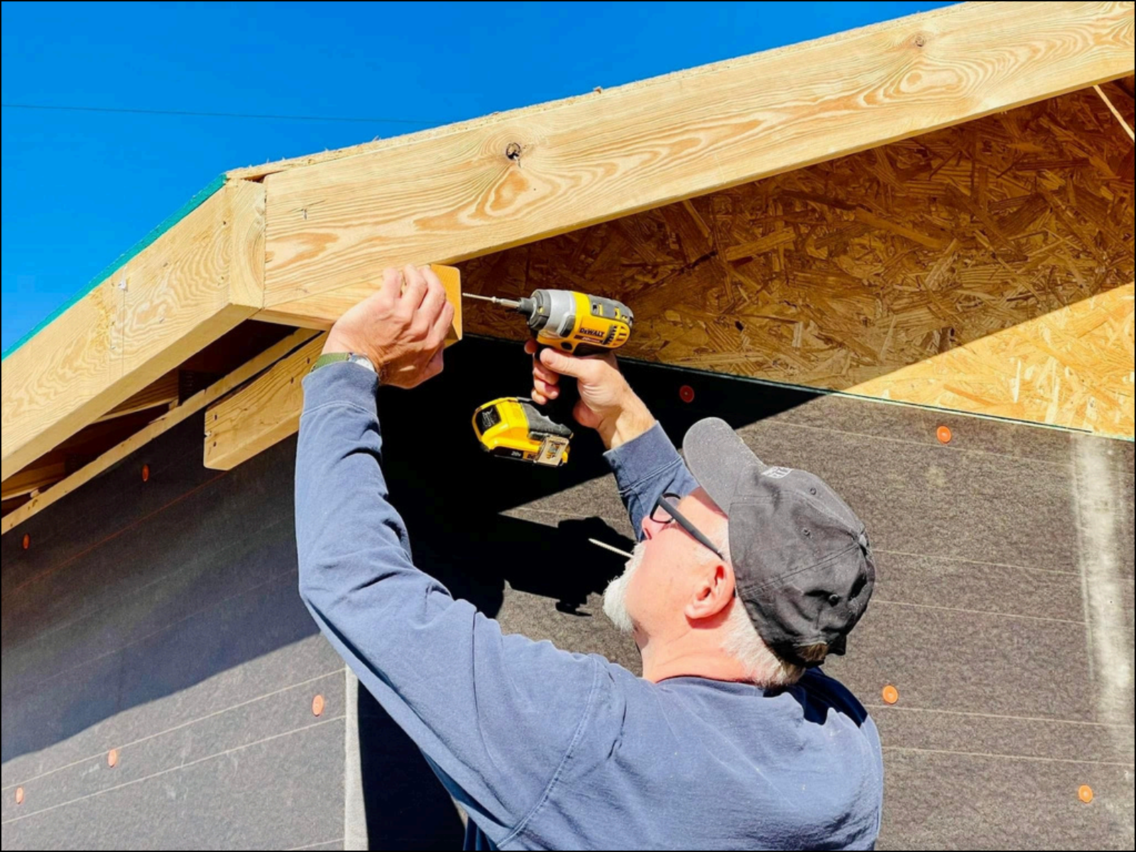
A volunteer from Gateway Church works on a Habitat home as part of a volunteer day earlier this year.